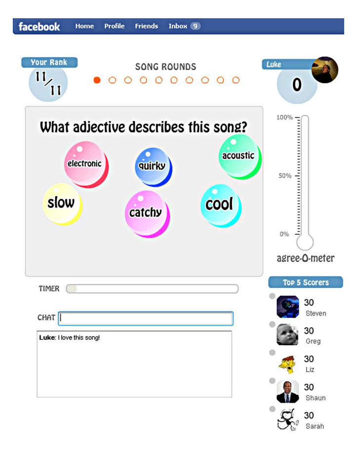
Figure 1: Herd It game screen.

The same clip of music is played to all players and a minigame quizzes players on their opinions about the music. The minigame might ask the player to select an appropriate musical sub-genre, the most prominent instrument, or a time when it would be good to listen to the piece of music. The minigame lasts 10-20 seconds and requires just a single click for the player to enter their choice. For example (see Figure 1), one minigame shows the player six bubbles floating around the play area, each containing adjectives that might describe the emotion evoked by the music. The player clicks the