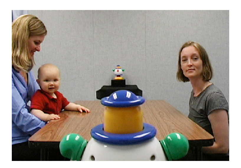
Figure 1.3 Gaze following by 1-year-old infants. Infants selectively look when the adult turns with eyes open versus eyes closed, showing they take into account the status of the adult's eyes, not just the gross direction of head movement.

following the "gaze" of the adult wearing the blindfold. They refrain from looking when the adult has closed eyes, but do turn to look when the adult has a blindfold. It is as if they do not understand that blindfolds block perception. Perhaps they understand eye closure more easily than blindfolds, because experience with their own eyes teaches them that this biological movement cuts off visual perception in their own case. Other explanations are possible, but if it could be substantiated, it would be a particularly compelling case of "like me" projection.