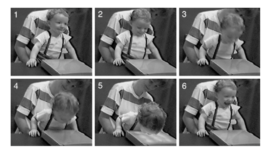
Figure 1.1 Imitation of a novel act by 14-month-old infants. None (0%) of the controls produced this behavior. There is a social-game quality to human imitation. Infants often smile after accurate imitation, as shown in panel 6. (From Meltzoff, 1999.)

The results showed that infants imitated after the 1-week delay (figure 1.1). Fully 67% of the infants duplicated the act, with a mean latency of 3.1 seconds after they were given the box. The control groups confirmed that 0% of the infants who had not seen the target behavior produced the behavior spontaneously. In the affordance control group, infants were simply given the object. This tested whether the object had visible properties that automatically provoked the response; the data showed it did not. In the stimulus-enhancement control group, an adult manipulated the object but refrained from performing the target act. This tested whether drawing infants' attention to the object led them to produce the behavior; it did not. An independent laboratory replicated this finding and confirmed that head touching was not an automatic response based on the object's properties, because there were conditions under which infants chose to duplicate the adult's behavior and conditions under which they did not (Gergely et al., 2002).